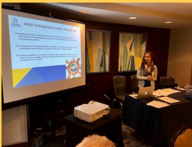
ISS-USA presents at Child Welfare League of America (CWLA) 's roundtable discussion on " Strengthening Families: Moving to a Global Perspective. "